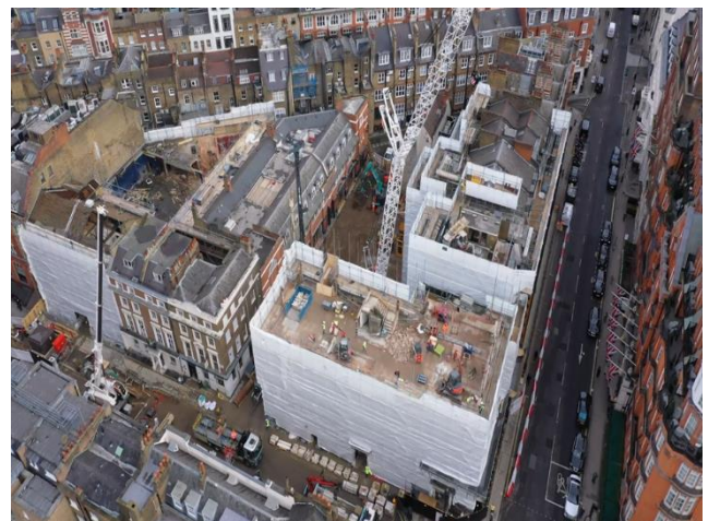
A drone shot of our works on site.